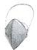
Dräger X-plore® 1710 Odour