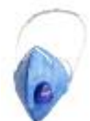
Dräger X-plore® 1710 V