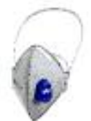
Dräger X-plore® 1710 V Odour