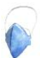
Dräger X-plore® 1710